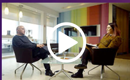
What our people say

But don’t just take our word for it – hear what some of our people have to say!